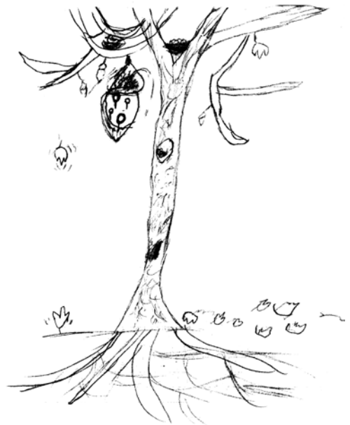
Dena, Age 11, of Akron

Kids!! Send us YOUR writing, drawings, thoughts, or ideas for the next Acorn... we would love to see your creative work in here!